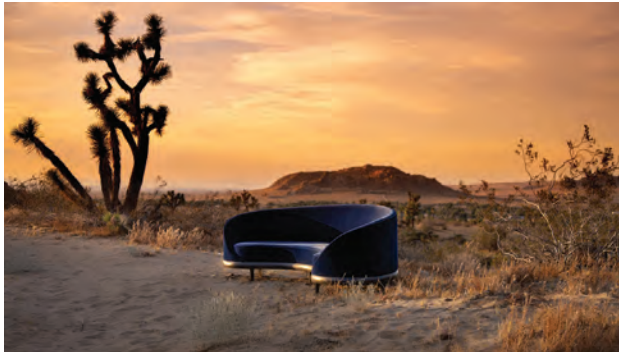
A. Rudin No. 2769 Sofa Upholstered in blue velvet using green practices. arudin.com