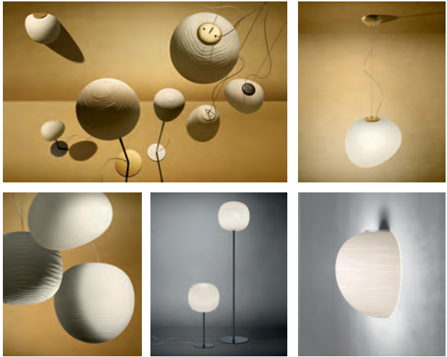
Foscarini Mix&Match Collection A blown glass lighting system with contemporary techniques and technologies using a traditional crafting process. foscarini.com