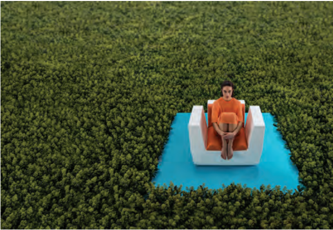
Maurizio Marcato Design in the Nature Photograph Winner of the Gold Award at BIFA 2019, features a woman sitting in Matali Crasset's Big Cut Armchair by Euro3Plast. mauriziomarcato.com