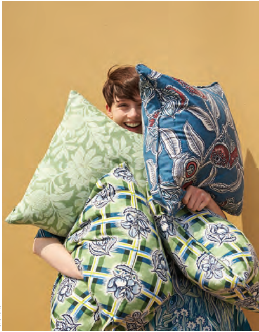
Utopia Goods Precious Collection Australian botanical handprinted linen cushion covers in Banksia Green (left), Madras Green (bottom) and Youngiana Indigo (right). utopiagoods.com