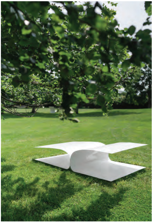
Nea Studio The Bird Bed and The Bird Chair Abstracted bird profiles carry connotations of flight The powder-coated recycled aluminum daybed holds two people on a single narrow spine or foot. The bed flexes comfortably under body weight and is accompanied with a removable waterproof round head pillow. The Bird Chair is a version of The Bird Bed. neastudio.com