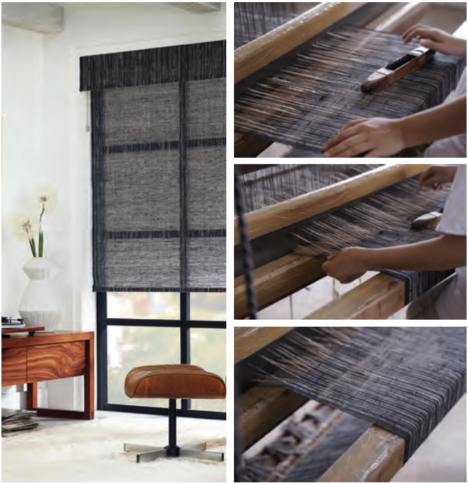
Jazz (in Legato colorway). Window coverings, Wallcoverings and Textiles handcrafted of sustainable natural materials Voted Top 100 Best Green Companies to Work for in Oregon each year for nearly a decade, Hartmann&Forbes employs age-old techniques that transform fibers into exquisitely handmade textiles. hartmannforbes.com