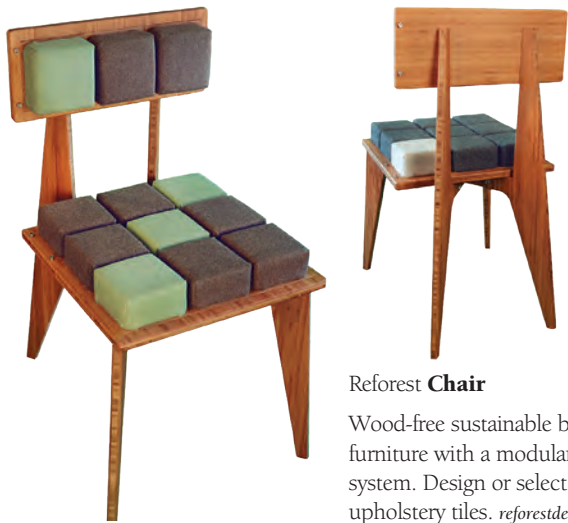
Reforest Chair Wood-free sustainable bamboo furniture with a modular frame system. Design or select your own upholstery tiles. reforestdesign.com