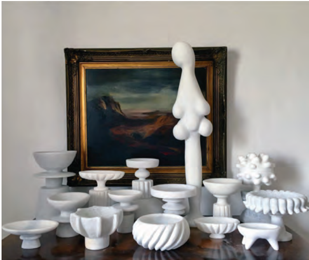
Naxian marble objects, vessels and sculptures Created by Swiss-born painter and sculptor Tom von Kaenel The stones come from the surrounding marble quarries of the Greek island of Naxos where von Kaenel lives. His work is deliberately left unpolished, giving them a unique liveliness. kalodromo.ch