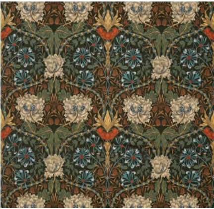
MORRIS & CO. ROUEN VELVETS Collection First produced in 1876, Honeysuckle & Tulip is an early Morris fabric design depicting entwined foliage and flower motifs in a mirrored pattern repeat. The effect is of a trellis circling large multi-petalled tulips and stylized honeysuckle. stylelibrary.com/morris&co