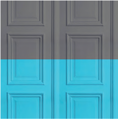
Mineheart Grey/Turquoise Panelling Wallpaper Explore the wondrous world of Mineheart wallpaper, combining traditional ideas of trompe l'oeil with contemporary design. Striving to provide the best of both quality and sustainability, all Mineheart wallpapers are made in England, printed with low VOC inks and one tree is planted for every roll of wallpaper sold. mineheart.com